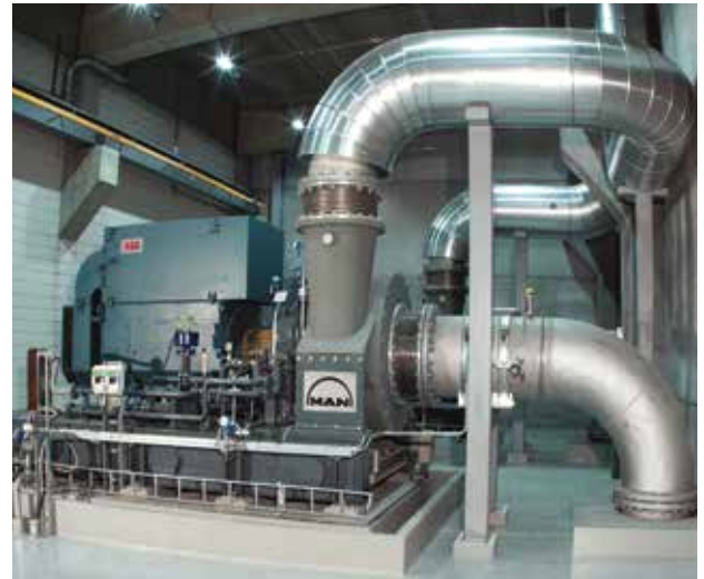
Type RT 71