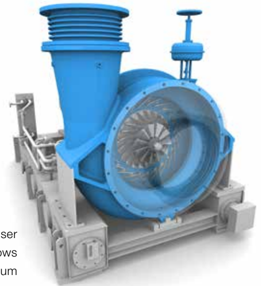
Type RT 71

When operated below minimum flow level, the blower will surge. To avoid this, an automatic valve bleeds air into the suction branch until stable operation is restored.